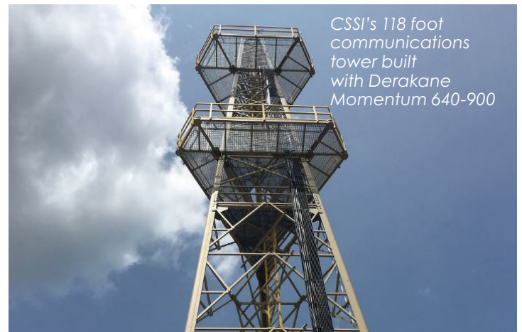
CSSI's 118 foot communications tower built with Derakane Momentum 640-900

The Ras Al Zour fertilizer complex in Ma'aden, Saudi Arabia includes a total of 16 large, draft-cell type cooling towers developed by Hamon Thermal Europe. Structural profiles and wall panels for the towers were fabricated with pultruded glass-reinforced plastic (GRP) and DM 640 Resin. Derakane resin was critical to achieve superior corrosion resistance to the aggressive chemical environment. A long lifetime without maintenance is projected and so fulfills the requirements of the owner.